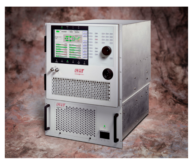
CPI 500 W L-band TWTA, Model VZL2780C2

Backed by over 40 years of satellite communications experience, and CPI's worldwide 24-hour customer support network that includes more than 20 regional factory service centers.