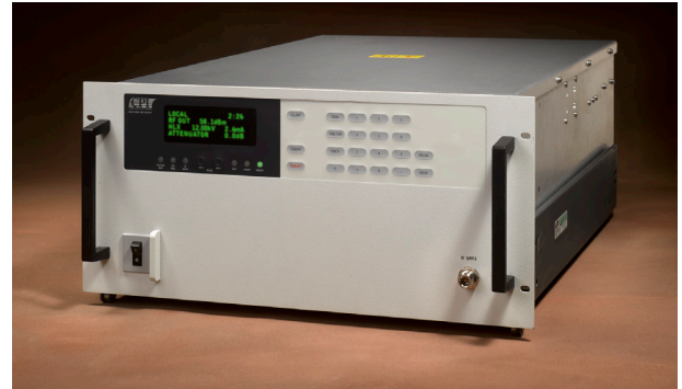
CPI 250/320 W S/C-band TWTAs, Model VZSC6963J2

Backed by over 40 years of satellite communications experience, and CPI's worldwide 24-hour customer support network that includes more than 20 regional factory service centers.